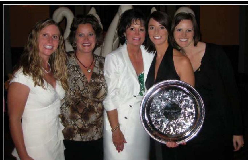
Nashville Kappa Delta Alumnae Chapter Winner of the 2009 Outstanding Alumnae Chapter Award. www.nashvillekdaa.com

If you have never been to a Kappa Delta National Convention, just imagine yourself with about 1,000 Kappa Delta sisters, dressed to the "nines", eating delicious food and laughing over funny stories. Then the lights dim, the National President comes to the podium and your immediate friends hear their names being called to receive the highest award of the night, the Outstanding Alumnae Chapter Award! What an amazing way to be recognized for all of our hard work over the past 60 years! That is how our Nashville Alumnae Chapter was honored in Orlando at the 2009 National Kappa Delta Convention.